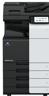
bizhub i-Series C360i