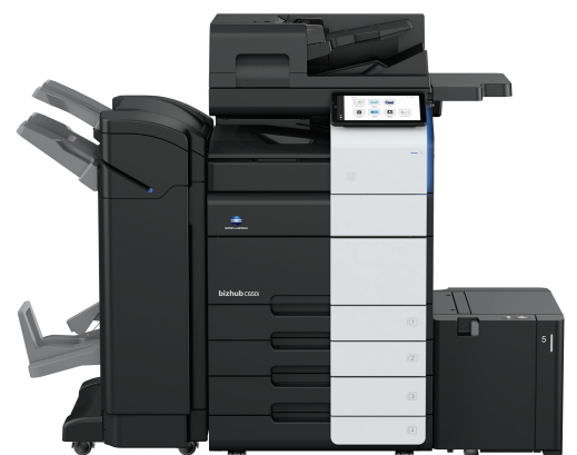
bizhub i-Series C650i