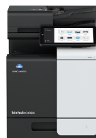
bizhub i-Series C4050i