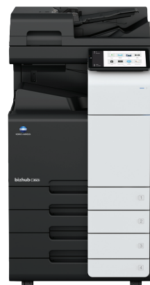
bizhub i-Series C360i