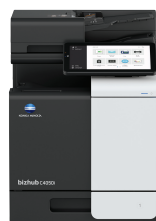
bizhub i-Series C4050i

To learn more, please visit workplacehub.konicaminolta.com