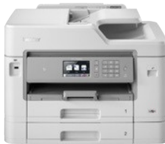
Business Inkjet Devices