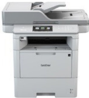
Professional Monochrome Laser Devices