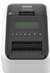
Professional QL Labellers