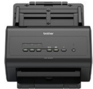
Business Document Scanners