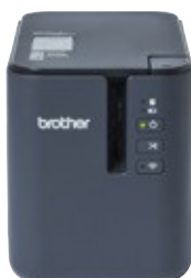
High-Volume Office Labellers