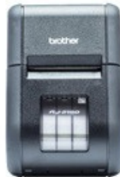
Rugged Receipt and Label Printers